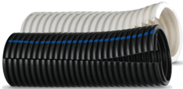
Series 123 Conduit Tubing