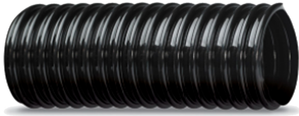
Series 122 MPI Cable Guard